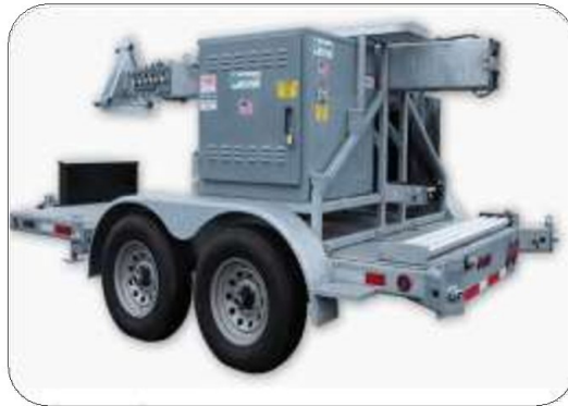
Cell Site on Wheels (COW)