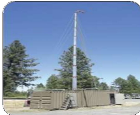
Integrated Container (BULL)