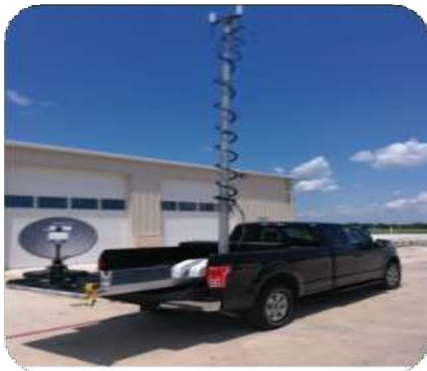
Cell Site On Light Truck (COLT)